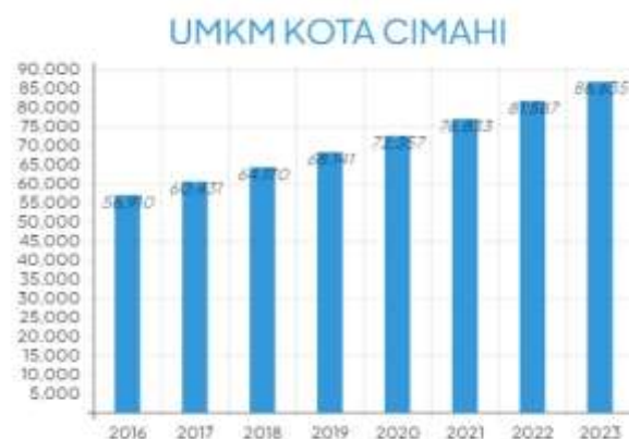
Figure 1 Number of MSMEs in Cimahi City, 2016–2023

As of 2023, 86,635 MSME units were registered in Cimahi City, and only 259 MSMEs have been certified halal (bakesbangpol.cimahikota.go.id). This means that 4% of MSMEs in Cimahi hold halal certification, indicating a lack of awareness among business actors regarding compliance with the standardization mandated by Law No. 33 of 2014 (opendata.cimahikota.go.id, 2023).